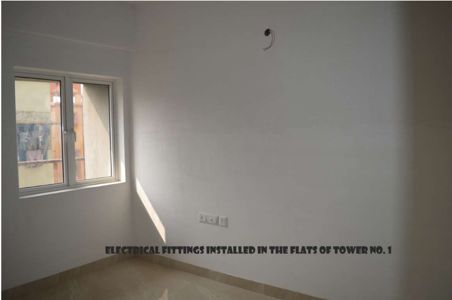
ELECTRICAL FITTINGS INSTALLED IN THE FLATS OF TOWER NO. 1