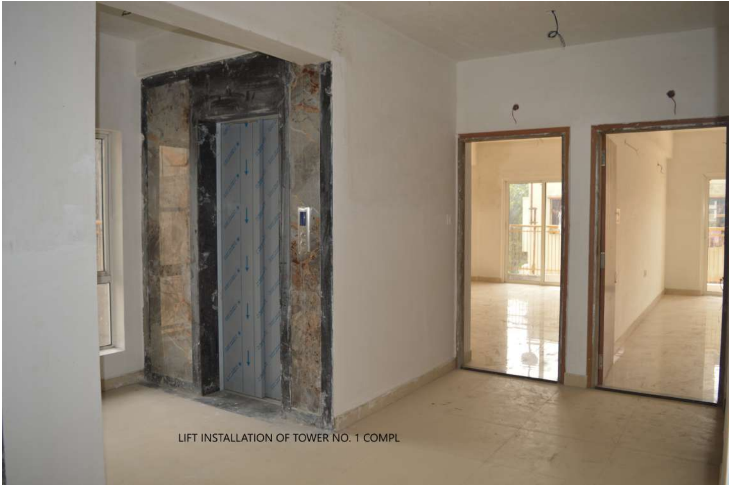
LIFT INSTALLATION OF TOWER NO. 1 COMPL