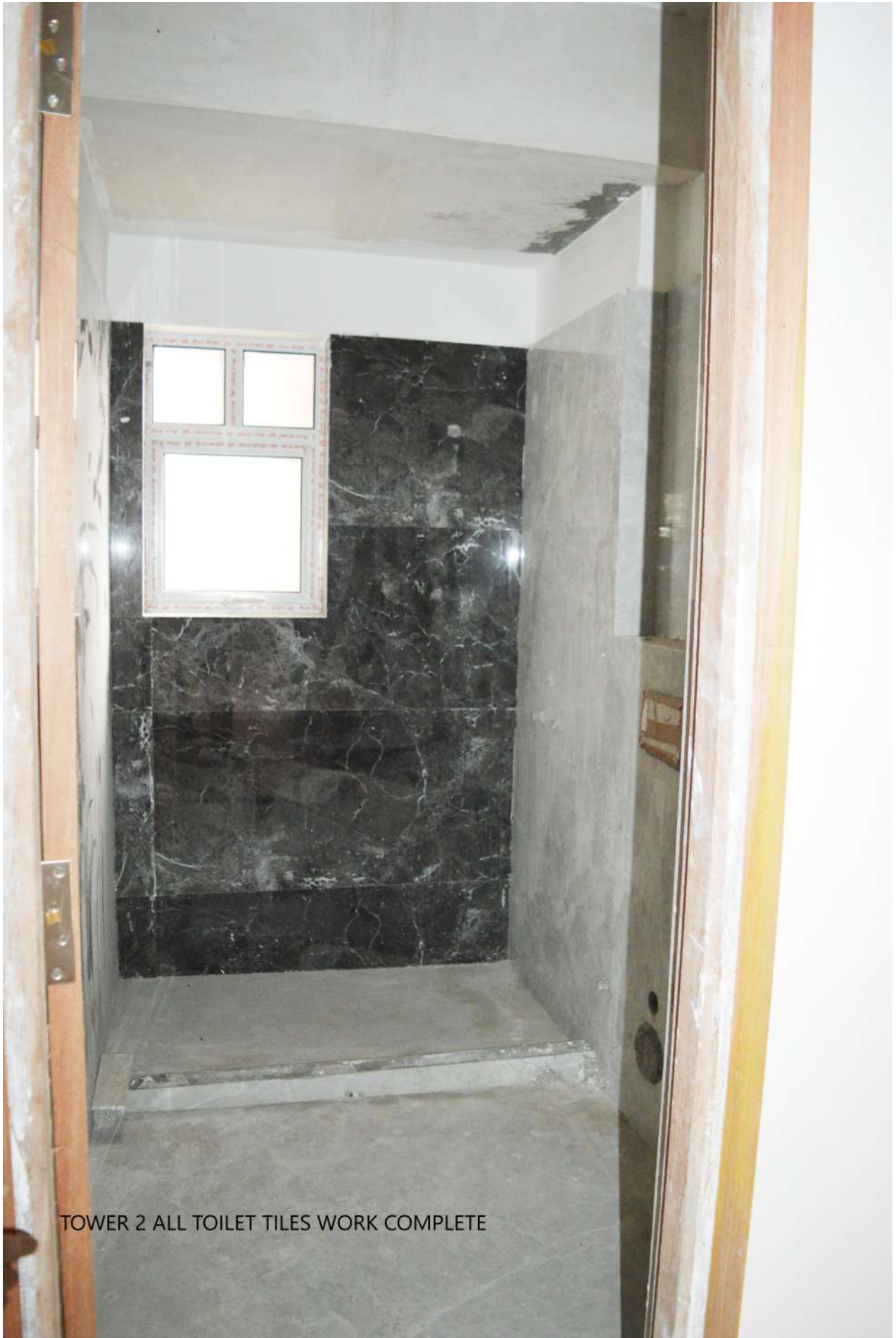
TOWER 2 ALL TOILET TILES WORK COMPLETE