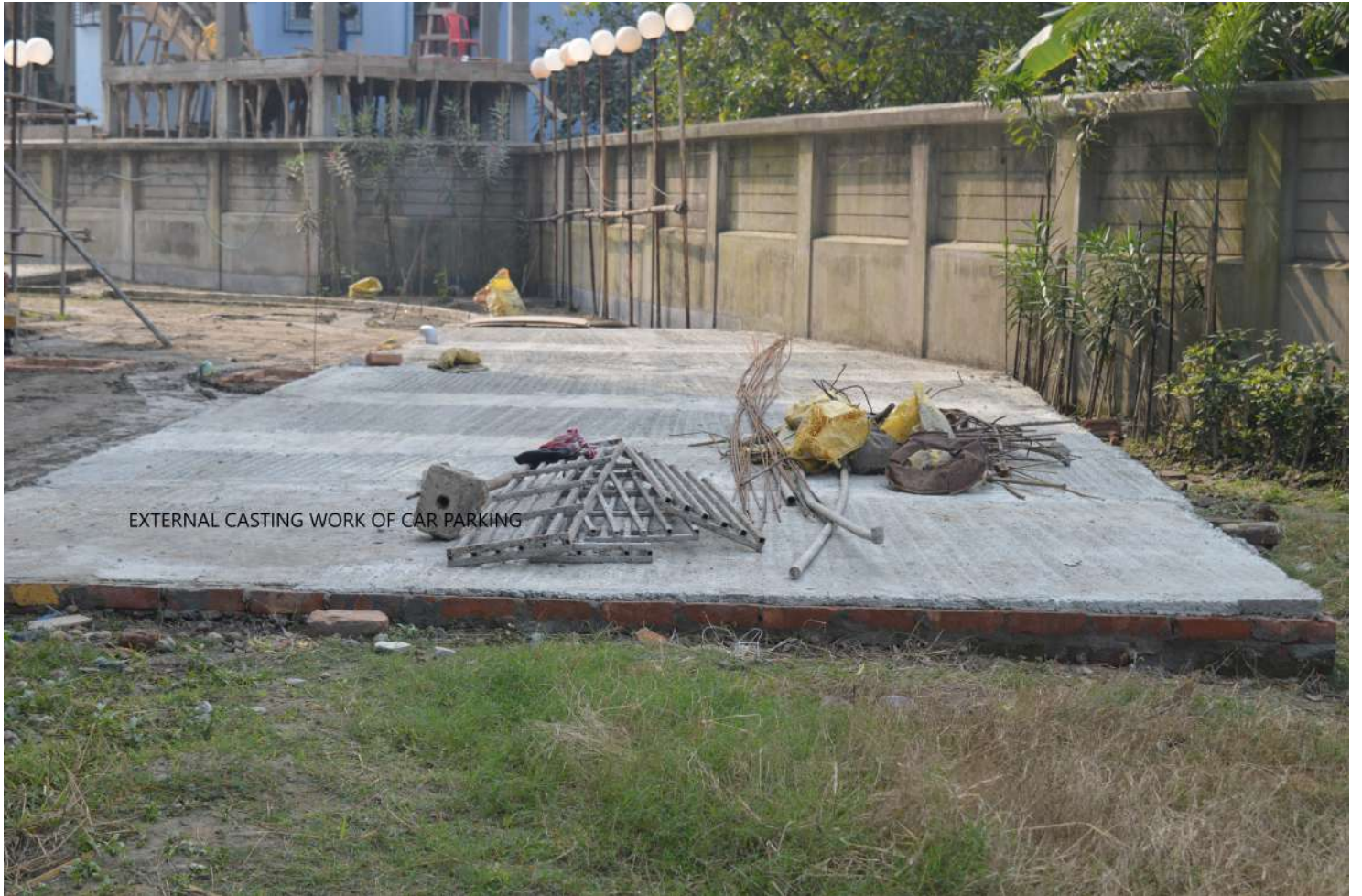
EXTERNAL CASTING WORK OF CAR PARKING