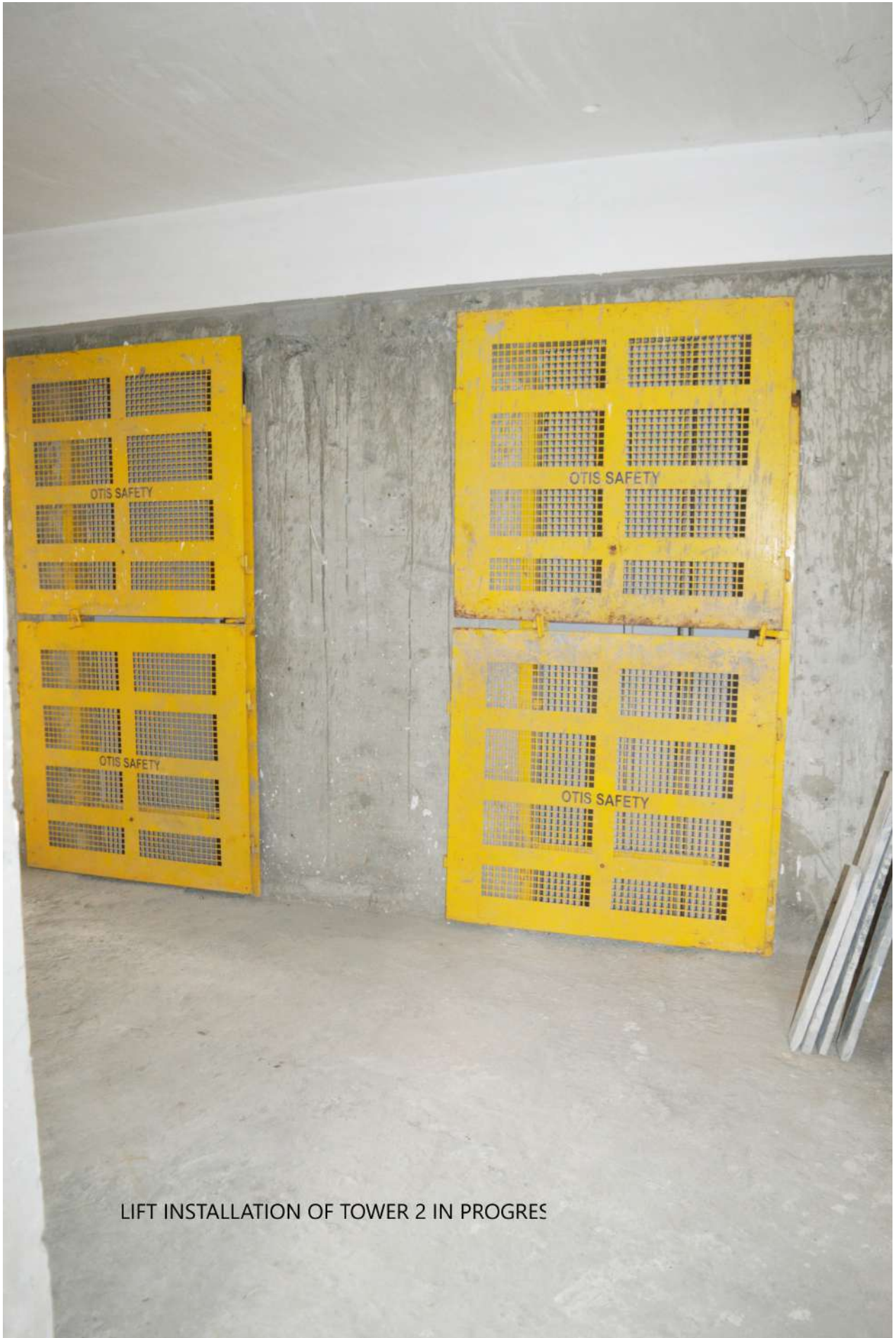
LIFT INSTALLATION OF TOWER 2 IN PROGRES