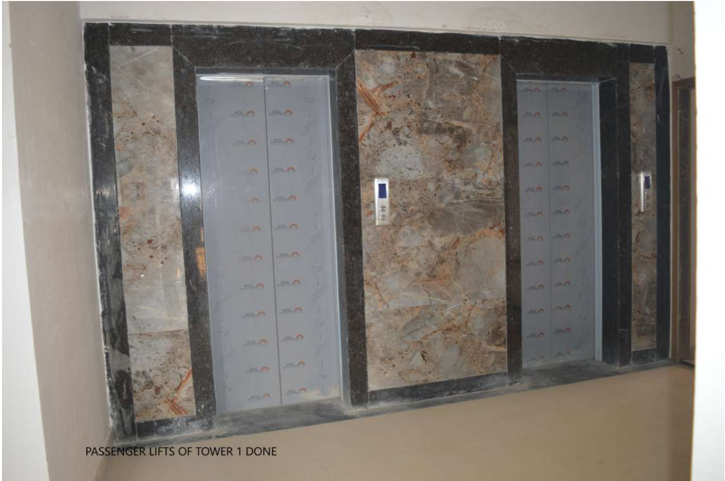
PASSENGER LIFTS OF TOWER 1 DONE