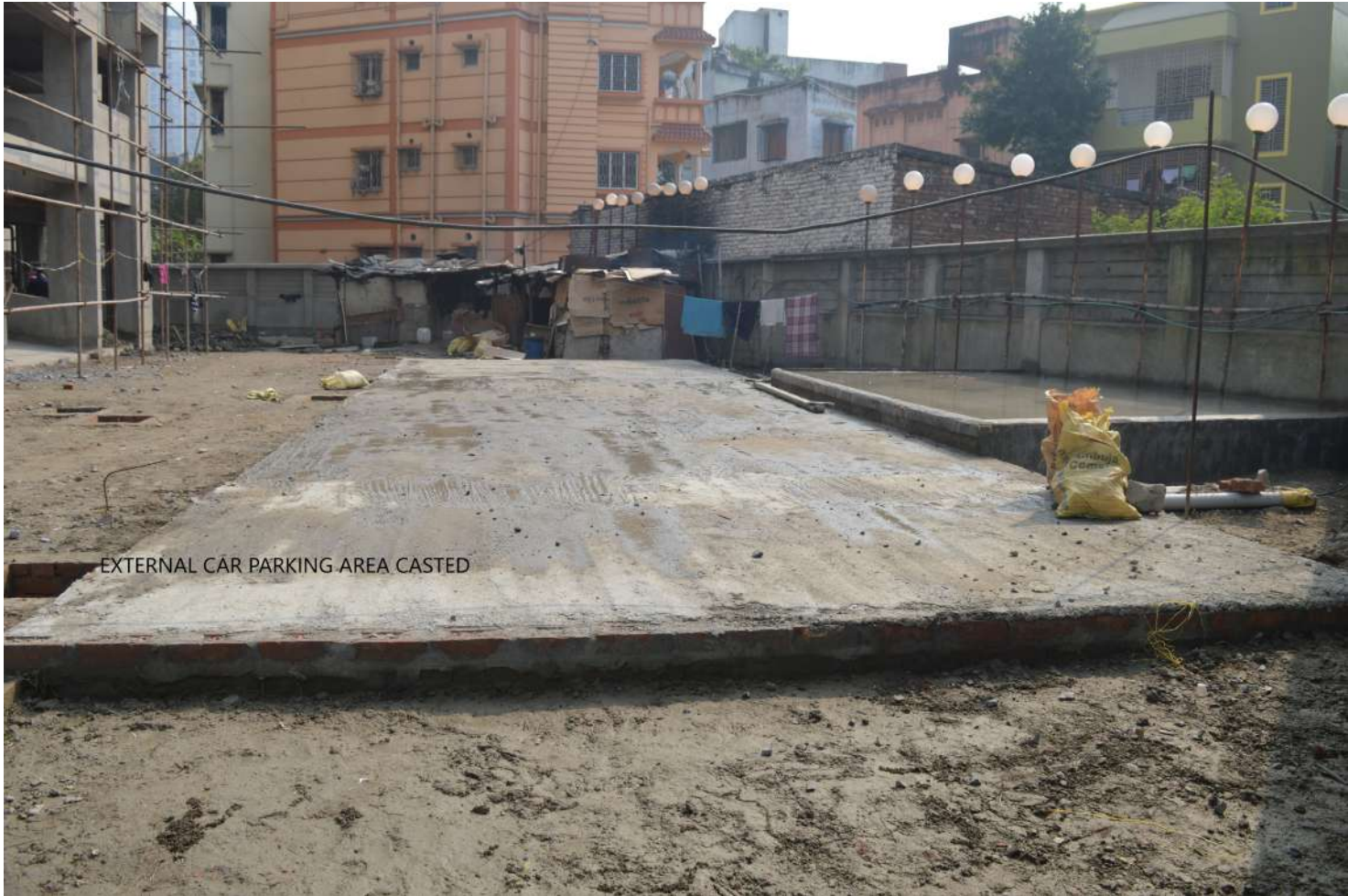
EXTERNAL CAR PARKING AREA CASTED