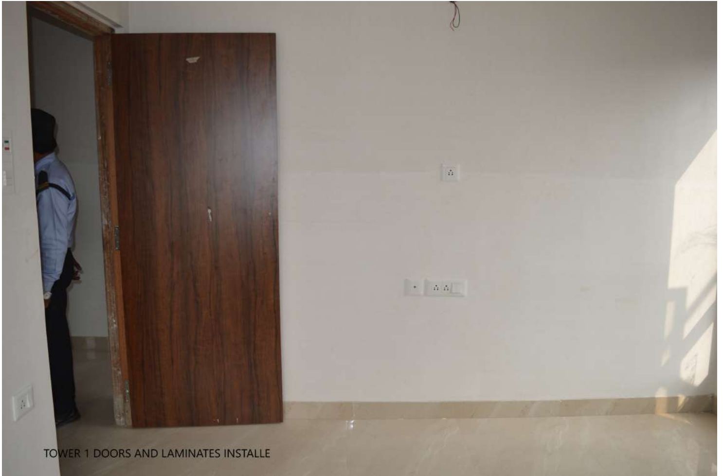
TOWER 1 DOORS AND LAMINATES INSTALLE