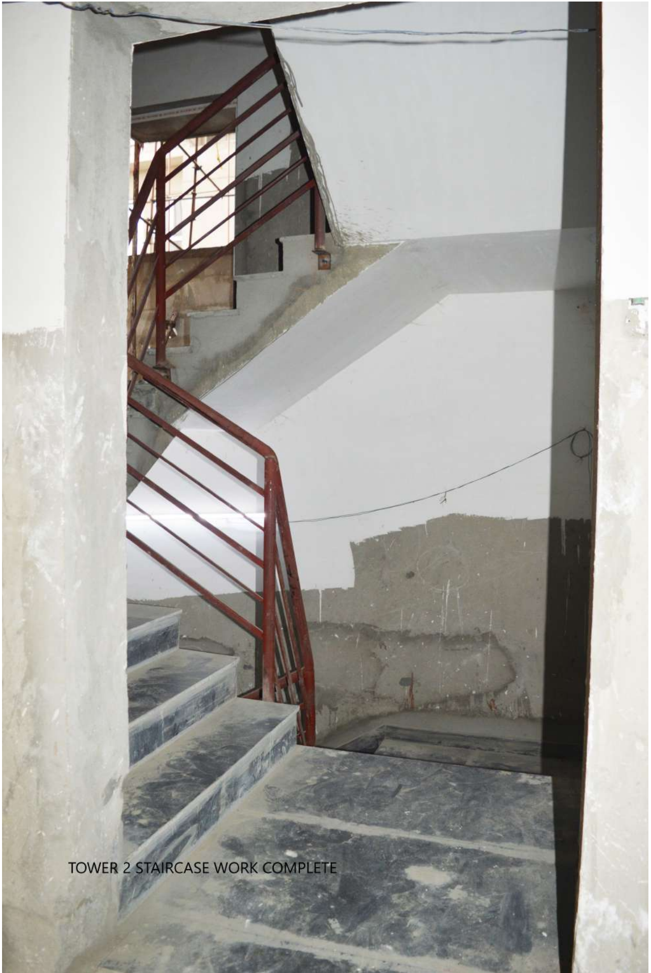
TOWER 2 STAIRCASE WORK COMPLETE