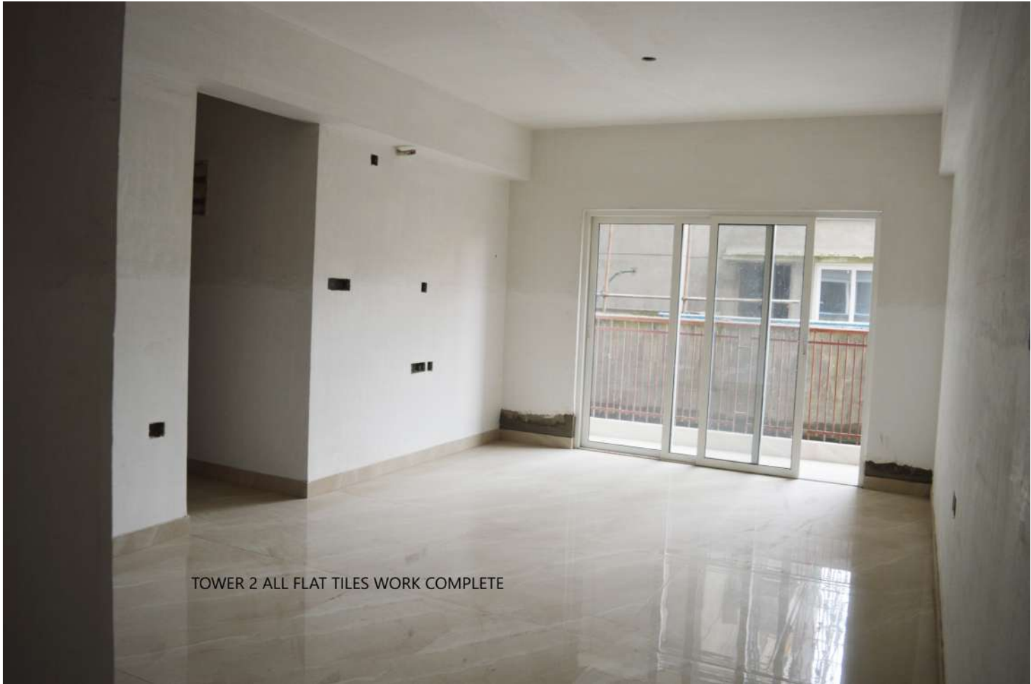
TOWER 2 ALL FLAT TILES WORK COMPLETE