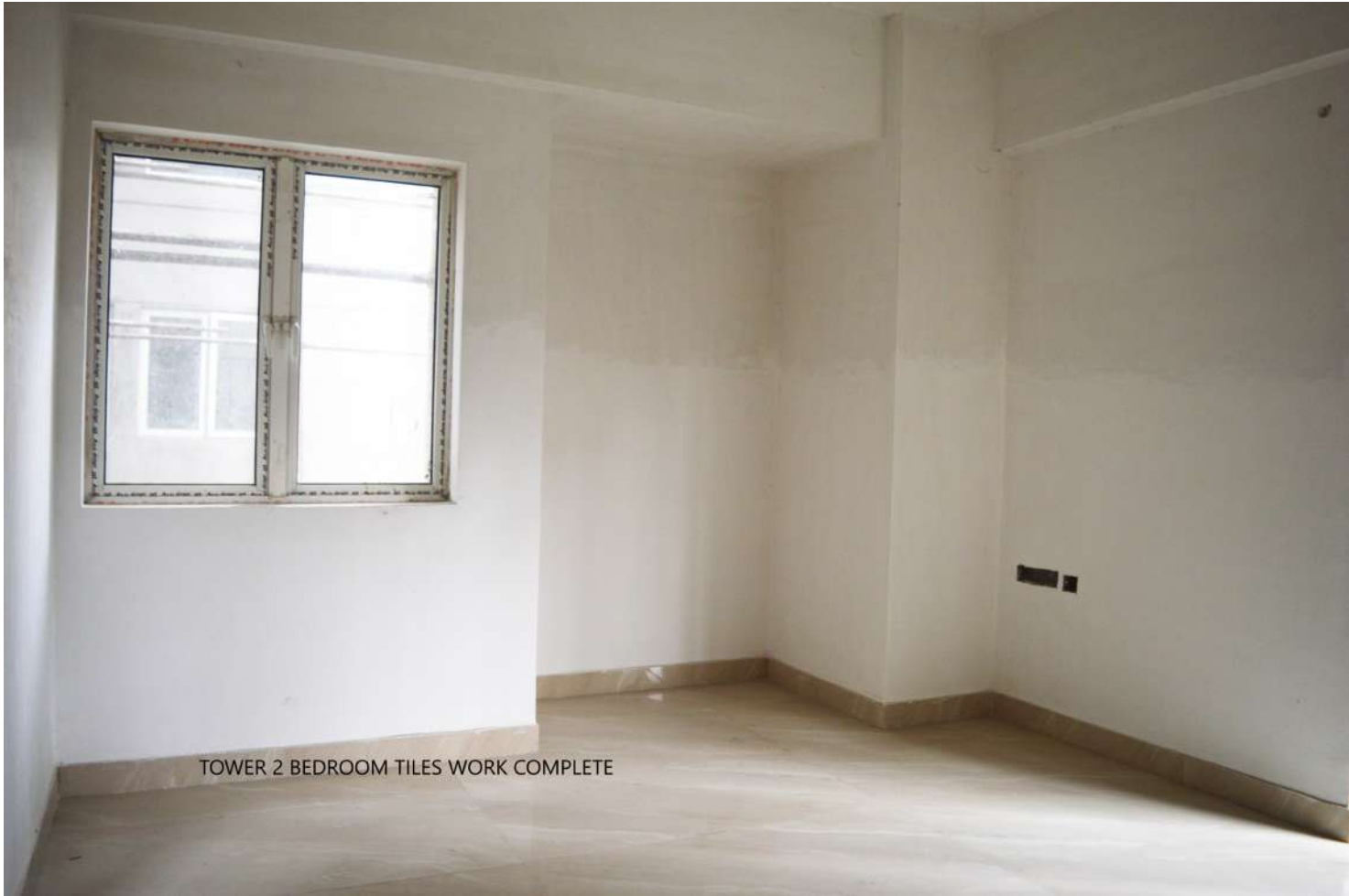
TOWER 2 BEDROOM TILES WORK COMPLETE