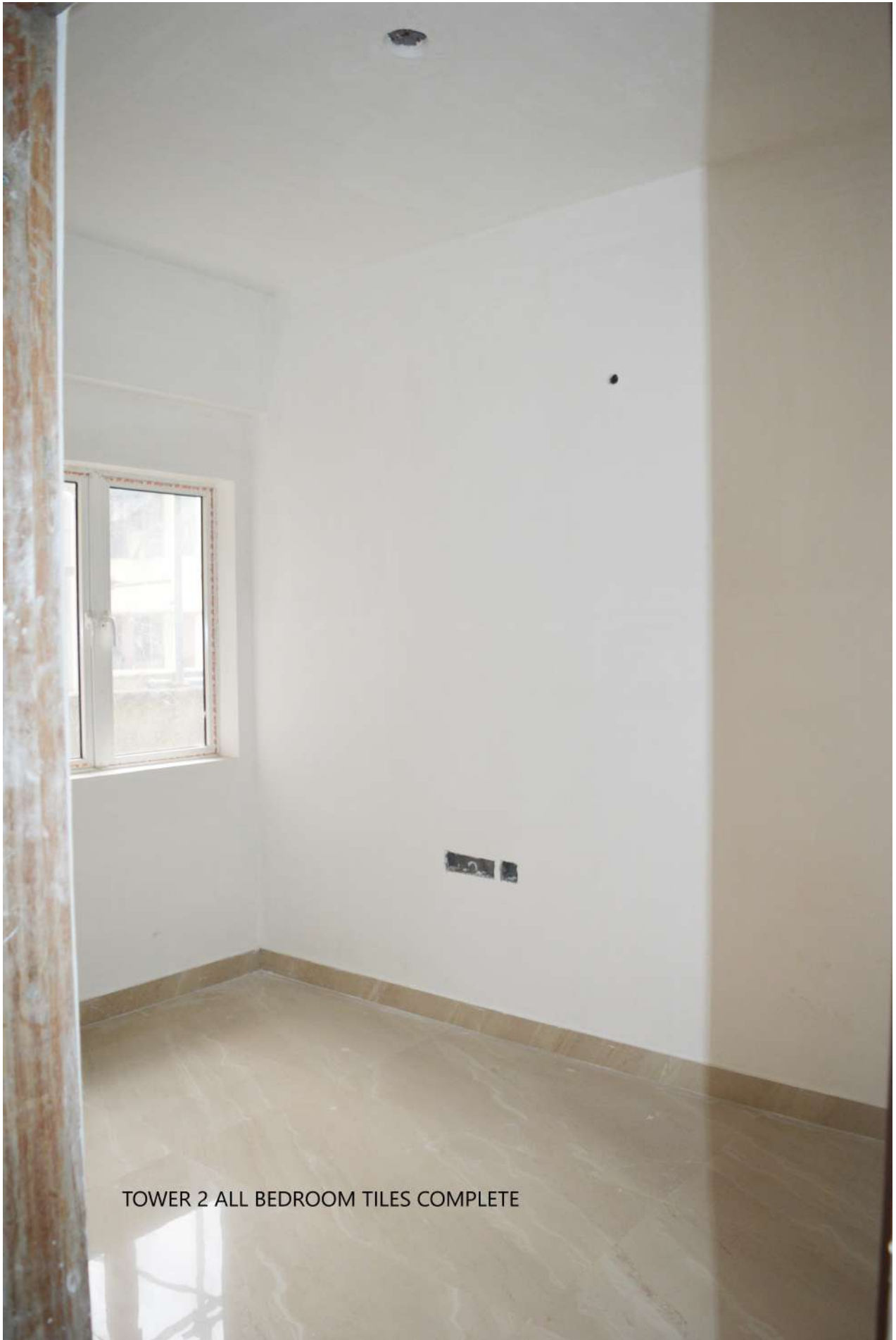
TOWER 2 ALL BEDROOM TILES COMPLETE