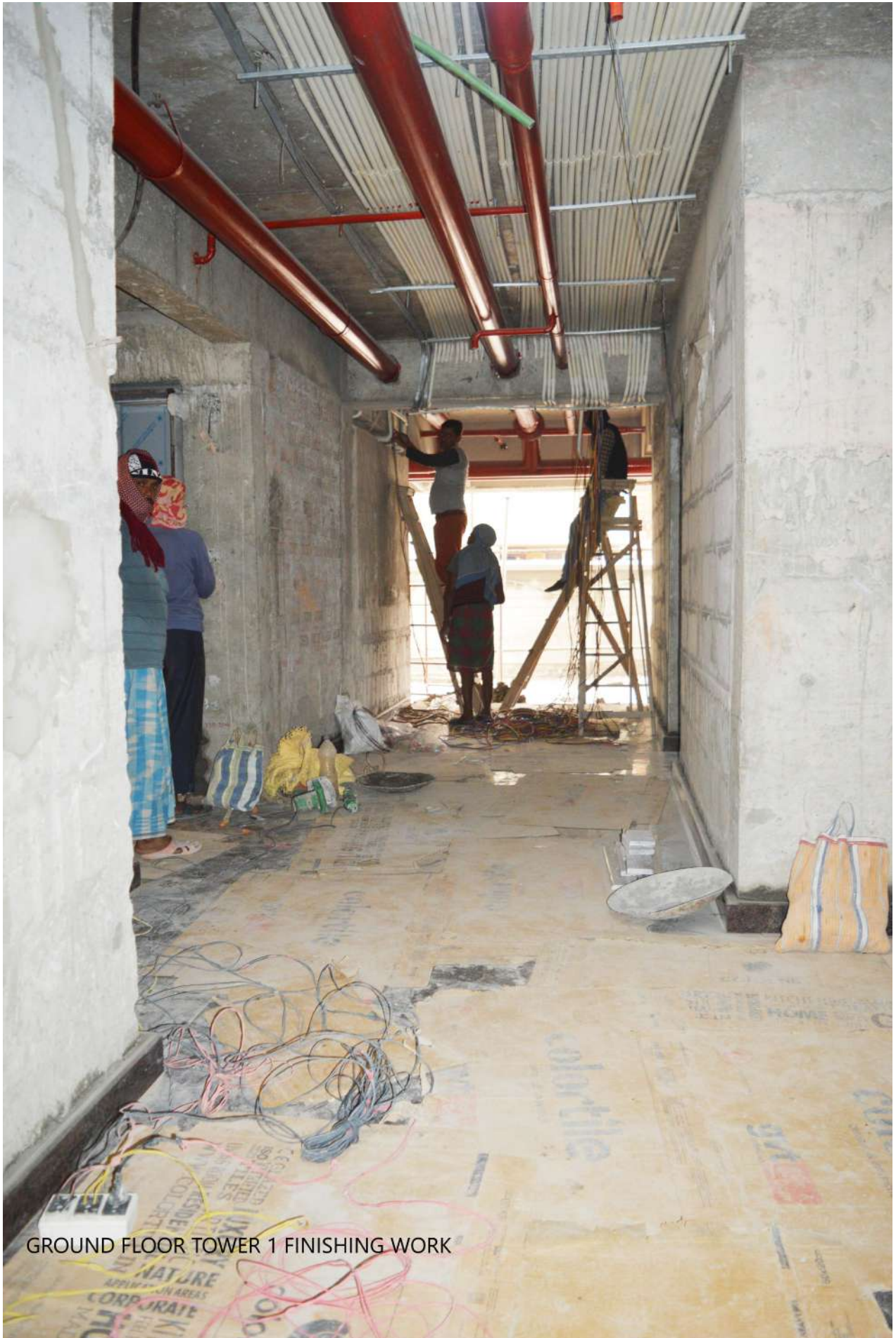
GROUND FLOOR TOWER 1 FINISHING WORK